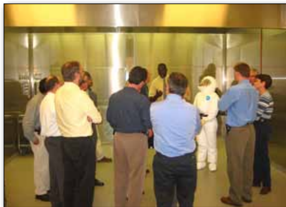
Representatives from USAMMDA observe the processes and equipment for manufacturing the Adenovirus Vaccine tablets at the new facility in Forest, VA.