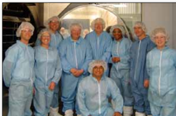
DoD and Barr production staff at the Barr facility in Forest, VA in March 2007.

A contract to develop and manufacture the types 4 and 7 adenovirus vaccine was awarded to Barr Pharmaceuticals in 2001. In July 2004, Barr submitted the Investigational New Drug (IND) application to the FDA. Clinical studies were carried out jointly by the Army and Navy. The Phase 1 clinical trial was completed in April 2005 at Fort Sam Houston, TX. A successful Phase 3 clinical trial began in September 2006 at Ft. Jackson, SC and Naval Training Center, Great Lakes, IL. A Biological License Application was submitted to the FDA in 2008 and approved in March 2011.